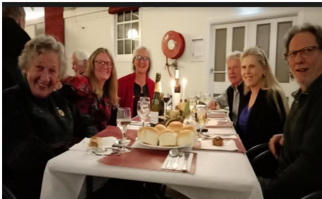
Some of our happy attendees.