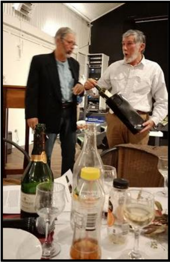
There are always nice surprises for our appreciated speakers.