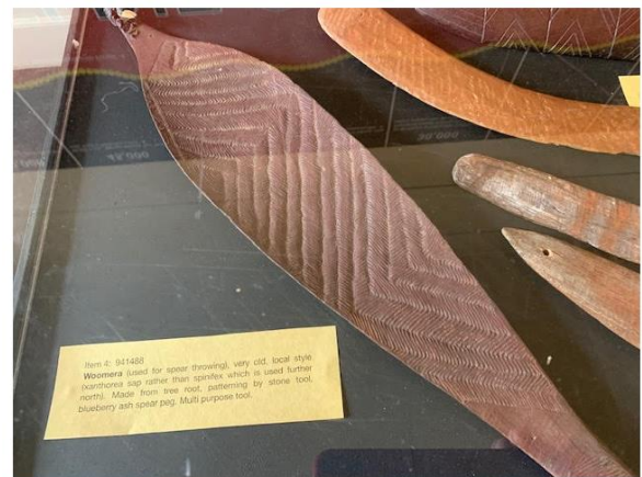
Woomera – made from tree root and xanthorea sap rather than spinifex.

In April 2019 the exhibition was ready, and its earliest visitors were Indigenous individuals and groups attending the 2019 Two Fires Festival. Their feedback was good, they were impressed. Uncle Max spent a lot of time showing younger Aboriginal men the artefacts and teaching them how they were made and used.