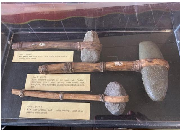
Stone axes with string binding and pecking decoration.